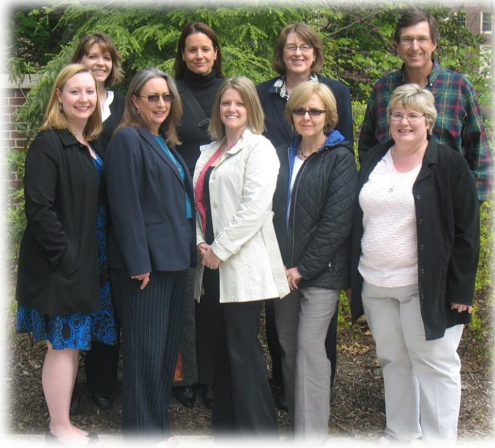
LSER/WC Team in 2009