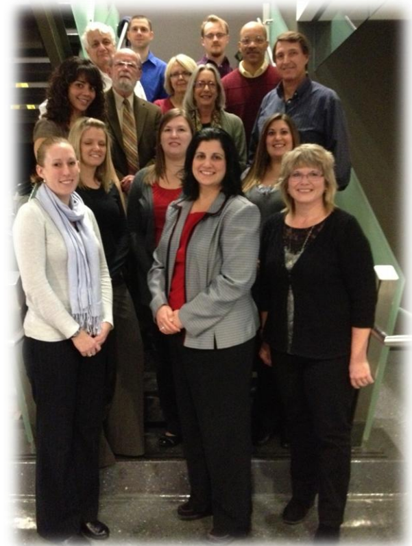
LSER/WC Team 2012